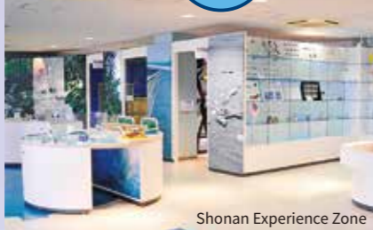
Shonan Experience Zone

Experience the beaches of Shonan in this hands-on learning center dedicated to knowing, learning, and thinking about the importance of our seashore. In addition to its interactive exhibits, the Beach Experience Hall offers numerous craft workshops and other hands-on learning programs that are open to everyone.