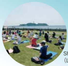
Shibafu Hiroba (Lawn area)

Tennis courts (paid) The bright courts atop the West parking area are the perfect spot for a game of tennis. • March through October 9:00-17:00 • November through February 9:00-16:00 Note: Rental rackets and lessons available [Contact] West parking area TEL.0466-35-0031