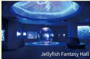
Jellyfish Fantasy Hall