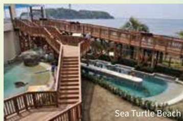
Sea Turtle Beach