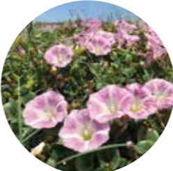
Beach morning glories blooming in the park