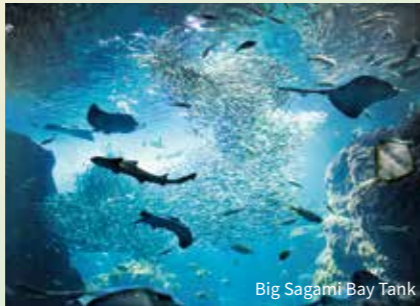
Big Sagami Bay Tank